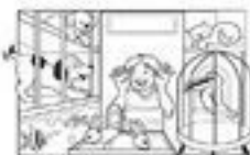
the pet shop