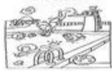
the swimming pool