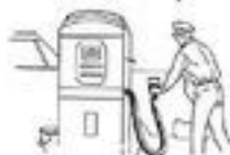
the petrol station