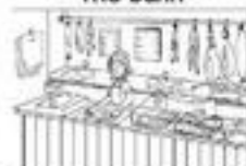
the butcher's (shop)