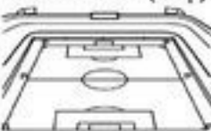
the football stadium