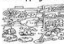
the toy shop