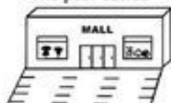
the shopping centre