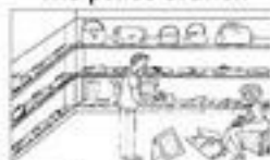
the shoe shop