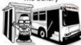
the bus stop