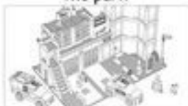
the police station